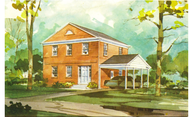
Concept Watercolor of "The Edgewood", circa 1960