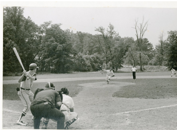
Baseball in Woodley Gardens Park, circa 1980

Modern Homes at 794, 796 798, and 800 Nelson Street